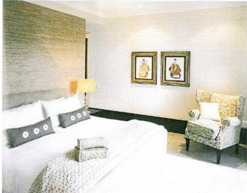
These spaces, Natural materials take precedence throughout and their inclusion reinforces the close association with the exterior. Practical yet aesthetically appealing, this is a synergy of architecture and interior design.