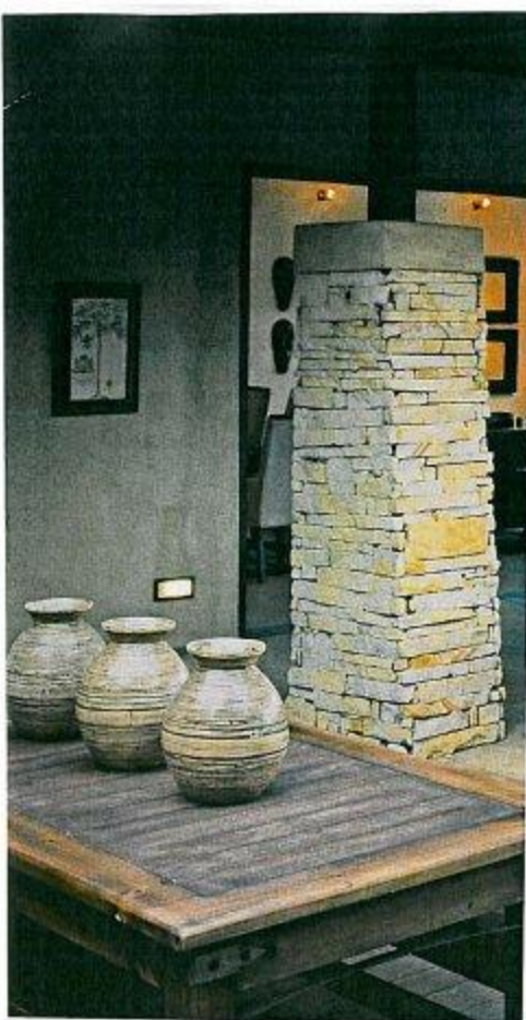
These spaces, exotic vegetation and spectacular trees form a backdrop to innovative architecture and detailed decoration. The result is a sense of permanence and establishment unusual in a new home. Elements include rustic timber pieces, dramatic ceramics and rich textures.