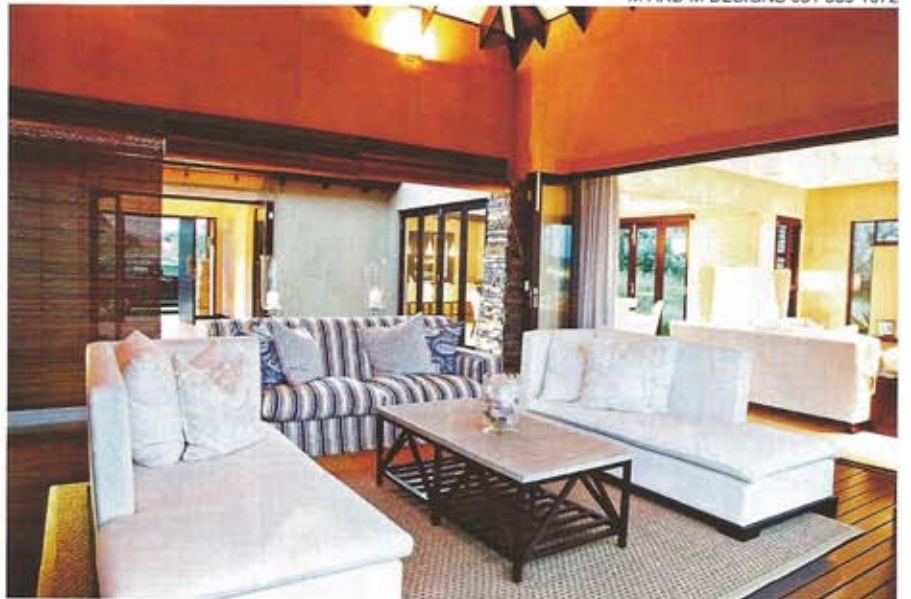
M AND M DESIGNS 031 539 1072

the best of our South African weather. The Zimbali structure and design lends itself to luxurious indoor-outdoor living, which was so important to the family as it allows for easy entertaining all year round. To make the best of the views, a mass of stacking doors cover the exterior all around the house, and together— with large windows, the home is filled with an array of natural light and opens